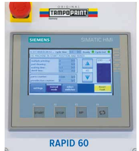
State-of-the-art operation via user-friendly touch display

The RAPID series is available with useful, practical and additional extensions for individual configurations. The optional ink residue pick-up system is recommended for consistent print quality. For the integration into automation