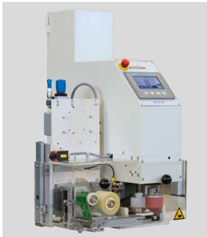
RAPID 60 built-in with optional ink residue pick-up system

The machines of the RAPID series are used for integration in fully automated processes in various industrial sectors, such as automotive, toys, medical technology and many more. They focus on product markings and decorations, which are produced in high quantities and at high process speed.