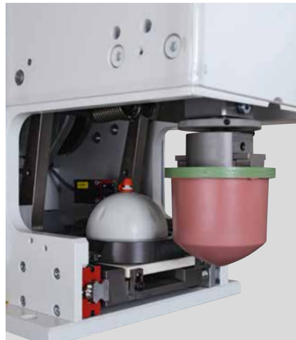
Print area RAPID 90

The machine impresses with its high speed and at the same time with its high repeat accuracy. Thanks to its smooth running, it provides for a stable and continuous printing process. The