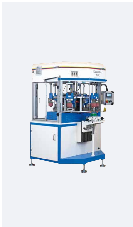
CONCENTRA 90-6 with jig

Ink residue pick-up system and integrated VIPA S7 PLC control are a standard option. Program enhancement possible at any time. Up to 10 program variants per printing station can be stored. Memory cards for additional jobs can be integrated in the external operator panel.