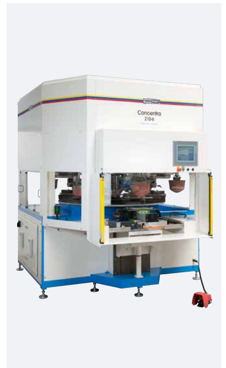
CONCENTRA 210-6 with light curtain (option)