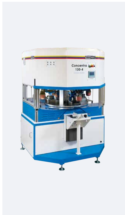
CONCENTRA 130-4 with x-y cross support (option)